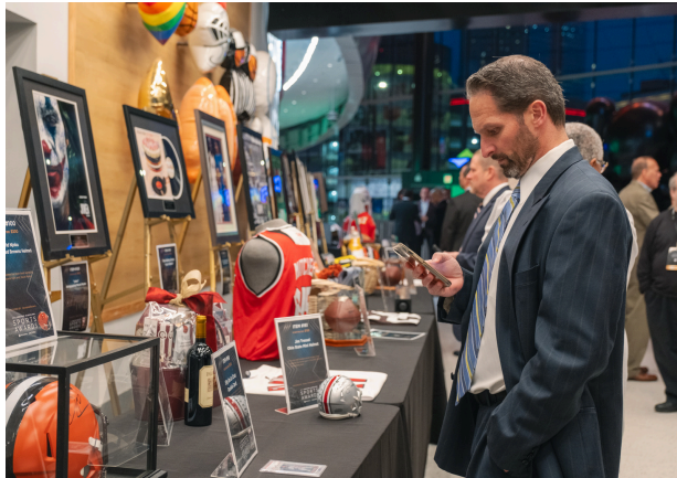
Q1: GREATER CLEVELAND SPORTS AWARDS SILENT AUCTION