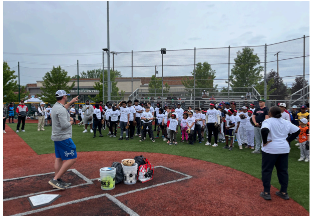
Q2: YES BASEBALL CLINIC DIII BASEBALL CHAMPIONSHIPS