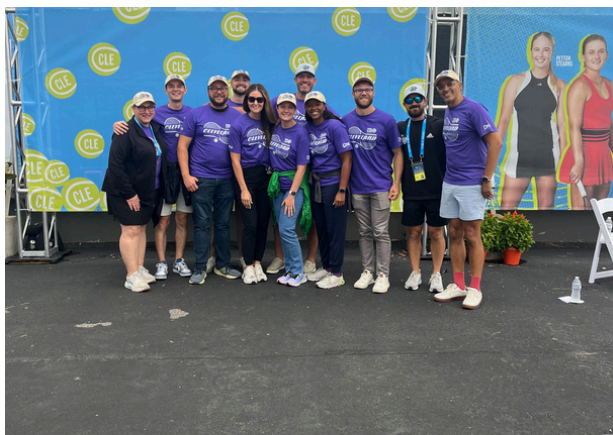
Q3: TENNIS IN THE LAND VOLUNTEERING